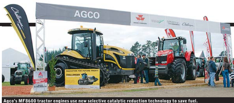
Agco's MF8600 tractor engines use new selective catalytic reduction technology to save fuel.